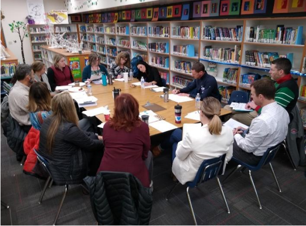
(Admin Team debriefing at Bryan Elementary)