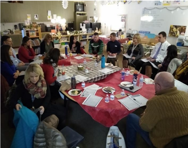
(Admin Team Discussing Observations at Ramsey)